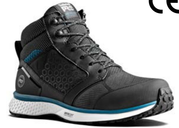
A2633 001 COMPOSITE SAFETY TOE Black/Blue