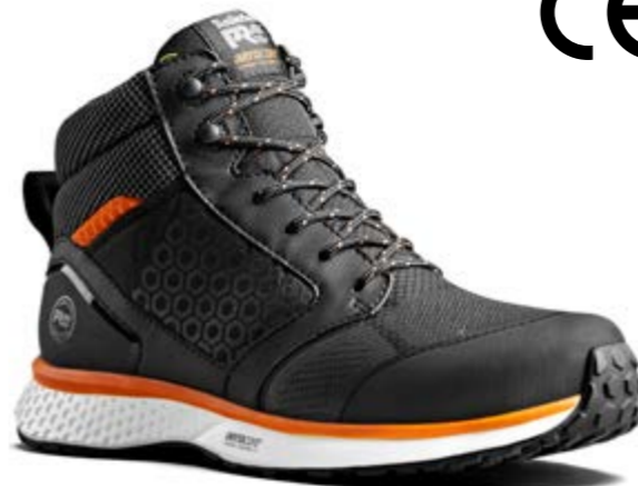
A263P 001 COMPOSITE SAFETY TOE Black/Orange