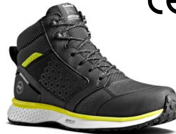
A25VS 001 COMPOSITE SAFETY TOE Black/Yellow